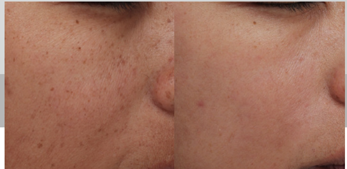
MOXI ™ + BBL ™ | 2 Months Post 3 Tx