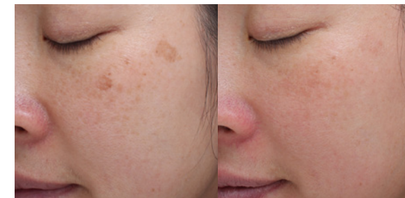
MOXI ™ + BBL ™ | 2 Months Post 5 Tx