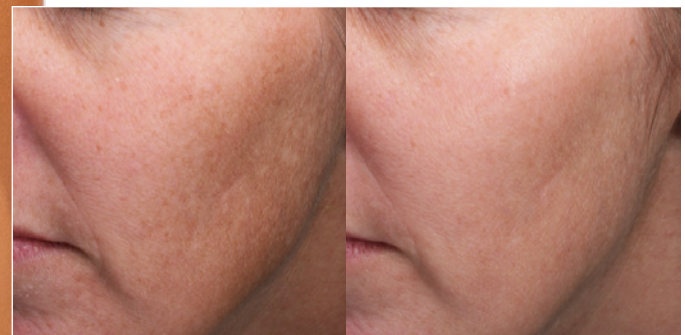
MOXI™ | Post 3 Tx | Courtesy of Aestheticare