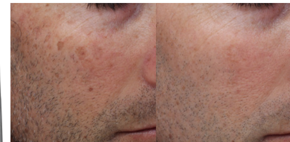
MOXI ™ + BBL ™ | Post 5 Tx