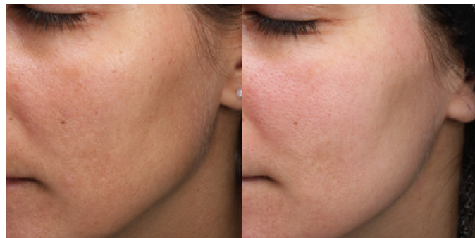
MOXI ™ | Post 3 Tx

Lighten, brighten and refresh with MOXI ™