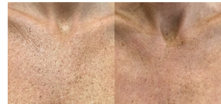
Forever Body ™ | 1 Month 1 Tx