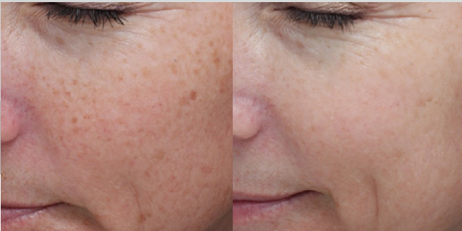
MOXI ™ + BBL ™ | 1 Month Post 1 Tx