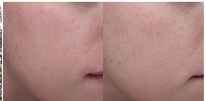
MOXI™ | 1 Month Post 2 Tx