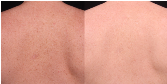
Forever Body™ | 1 Month 3 Tx