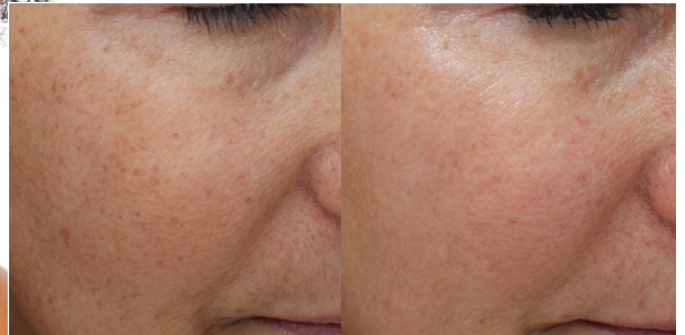
MOXI™ | Post 3 Tx